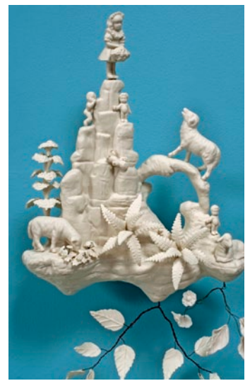
Facing Page, Top: Folly (Installation) . 2011. Below: Drowning Baby (Detail) . Above left: The Gift That Keeps on Giving (Detail) . Above centre: Elf, Snail, Sacre Coeur (Detail) . Above right: Flower Girl with Sheep (Detail) .

owls are much larger than the women. This play on scale is a motif that Katleman uses throughout the installation to rupture the uniformity of the white landscape. The over-sized animal creatures dominate over the human figures and architectural landmarks.